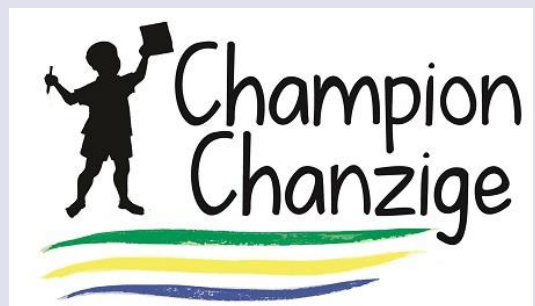
Sixth Form and Tanzania